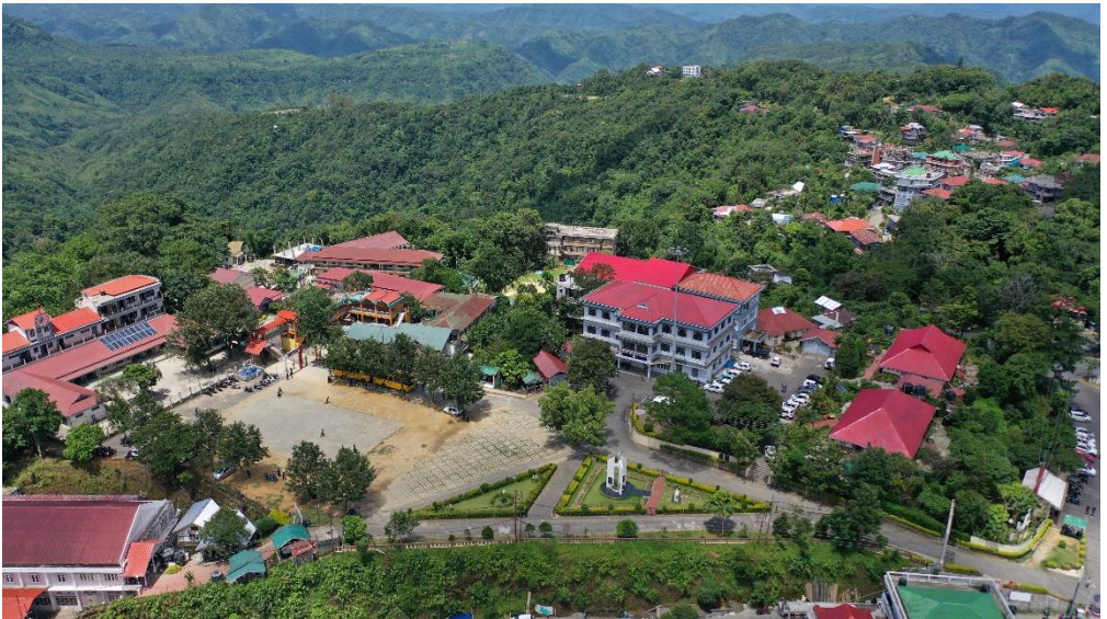
Aerial view of the Baptist Church of Mizoram, Lunglei.

was established on March 21, 1966. Aijal and Lungleh were former names for today's Aizawl and Lunglei, respectively. Some of the services rendered by the Committee were the supply of basic needs such as food, water, medicines; return of surrendered arms to army officials; motor transport for bringing back civilians; and relief to homes for motherless babies, among others. 56